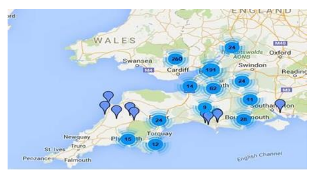
Figure NGM2 Location of microelectronics companies (no data for Cornwall).

The region is home to around 685<sup>15</sup> microelectronics companies with particular concentrations around Bath, Bristol, Cardiff, Exeter, Plymouth and Torbay see figure NGM2. These companies have a combined turnover in excess of £1.6Bn and employ 8400 people across the region<sup>16</sup>. Such employment is particularly important as the wages within the sector are substantially higher than the regional average.